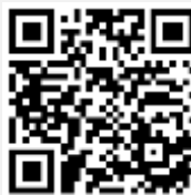
User Manual e-Voting