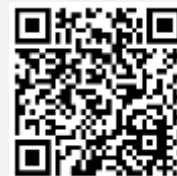
Video of using Inventech Connect

* Note Operation of the electronic conferencing system and Inventech Connect systems. Check internet of shareholder or proxy include equipment and/or program that can use for best performance. Please use equipment and/or program as the follows to use systems.